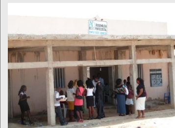
A growing church in Luanda