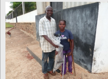
Loving the children - new crutches!