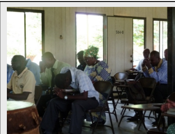
Bible School students in prayer

ABOUT OUR MAILING ADDRESS: At this time we are not able to receive physical letters or packages. A government matter has closed the postal system to letters to and from the United States. We trust this is only a temporary issue and we will let you know when circumstances change. Until then, please keep in touch via one of the above contact methods.