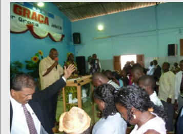
All of Heaven rejoices in their decision!